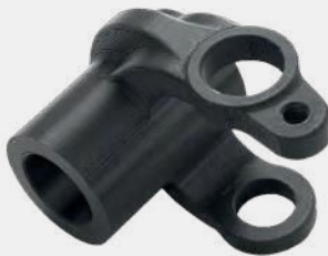
3 PRINTED MODEL