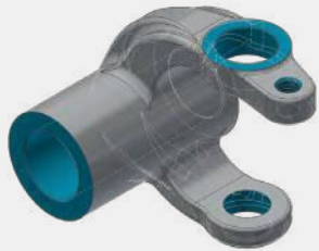
2 3D DESIGN