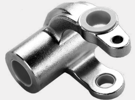
5 FINAL PRODUCT